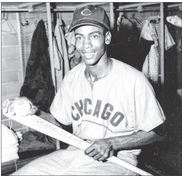
1955 AP photo

Days gone by: Fans line up outside Weeghman Park, home of the Chicago Whales, in 1914. The Whales were replaced as the ballpark's home team by the Cubs in 1916, and Weeghman Park was renamed Wrigley Field in 1927.